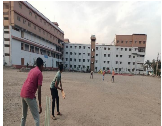
Volley Ball Ground